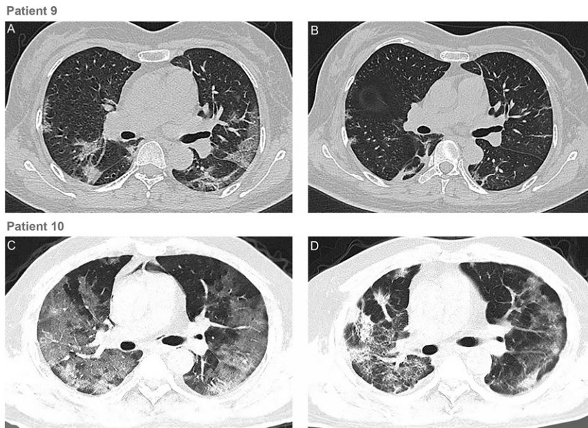
Fig. 1. Chest CTs of two patients. (A) Chest CT of patient 9 obtained on February 9 (7 dpoi) before CP transfusion (10 dpoi) showed ground-glass opacity with uneven density involving the multilobar segments of both lungs. The heart shadow outline was not clear. The lesion was close to the pleura. (B) CT Image of patient 9 taken on February 15 (13 dpoi) showed the absorption of bilateral ground-glass opacity after CP transfusion. (C) Chest CT of patient 10 was obtained on February 8 (19 dpoi) before CP transfusion (20 dpoi). The brightness of both lungs was diffusely decreased, and multiple shadows of high density in both lungs were observed. (D) Chest CT of patient 10 on February 18 (29 dpoi) showed those lesions improved after CP transfusion.

Adverse Effects of CP Transfusions. Patient 2 showed an evanescent facial red spot. No serious adverse reactions or safety events were recorded after CP transfusion.